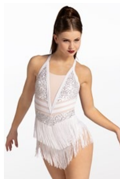
Million Dollar Baby